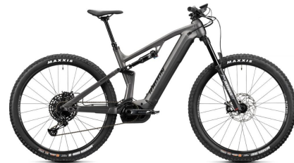
RADON RENDER AL 8.0 750 3.607€