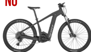
SCOTT ASPECT ERIDE 920