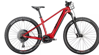
CONWAY CAIRON S 6.0 3.999€