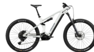
RADON RENDER AL 7.0 625