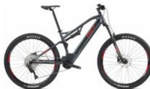
BH ATOM LYNX 8.0