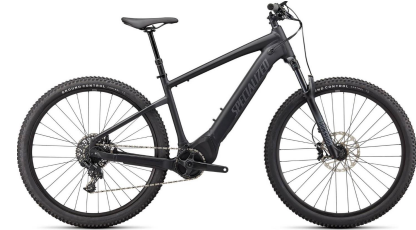
SPECIALIZED TURBO TERO 4.0 3.999€