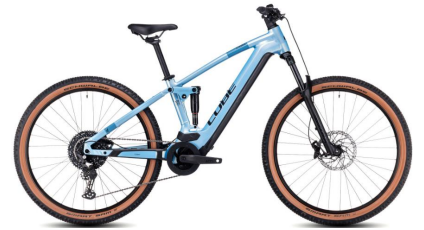
CUBE STEREO HYBRID 120 PRO 625