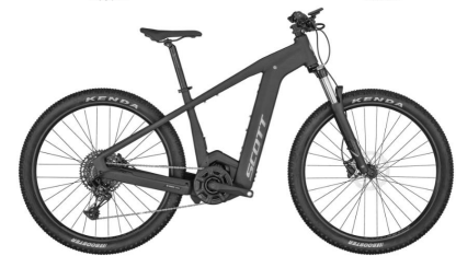
SCOTT ASPECT ERIDE 920 3.399€