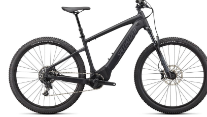
SPECIALIZED TURBO TERO 4.0