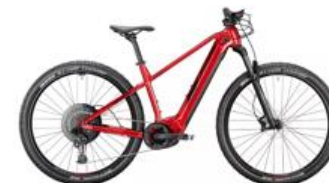
CONWAY CAIRON S 6.0