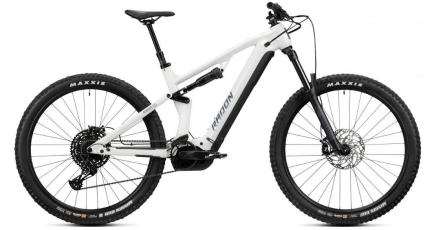
RADON RENDER AL 7.0 625