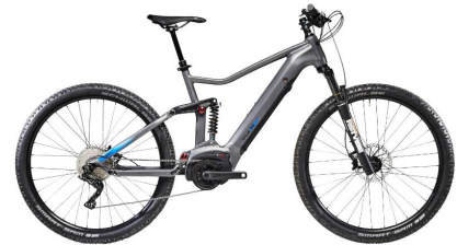
ROCKRIDER STILUS E-TRAIL 2.700€