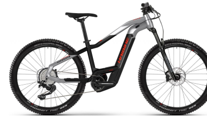
HAIBIKE HARDSEVEN 9