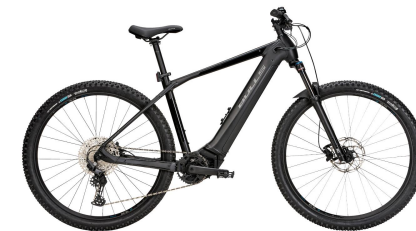
BULLS COPPERHEAD EVO 2 29 3.899€