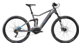
ROCKRIDER STILUS E-TRAIL