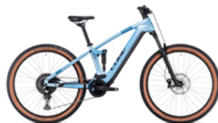
CUBE STEREO HYBRID 120 PRO 625