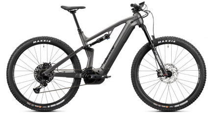
RADON RENDER AL 8.0 750