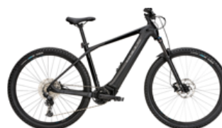
BULLS COPPERHEAD EVO 2 29