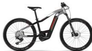
HAIBIKE HARDSEVEN 9