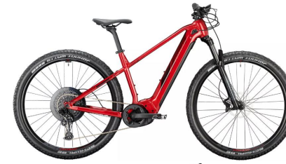
CONWAY CAIRON S 6.0