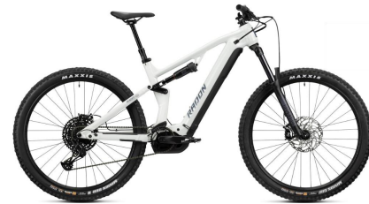
RADON RENDER AL 7.0 625 3.197€