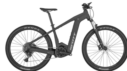
SCOTT ASPECT ERIDE 920