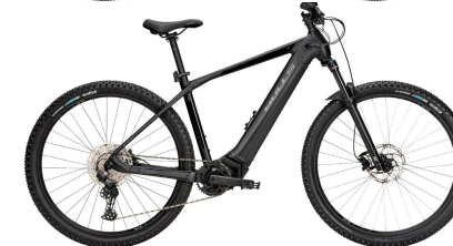
BULLS COPPERHEAD EVO 2 29