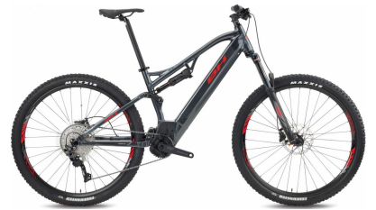
BH ATOM LYNX 8.0 3.199€