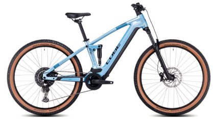
CUBE STEREO HYBRID 120 PRO 625 4.050€