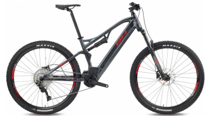
BH ATOM LYNX 8.0